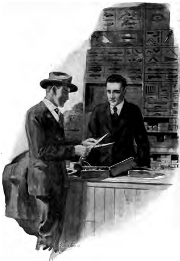
“ SNIPPED THREE SHORT PIECES OF WIRE FROM THE COIL ”